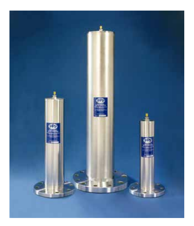
40 Years of outstanding performance