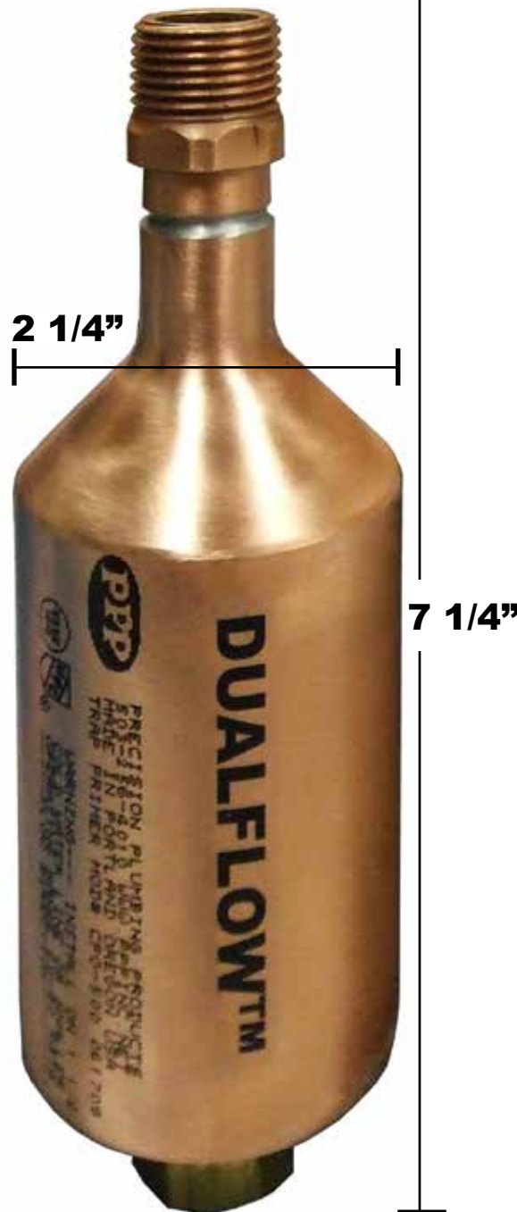
PART NO: CPO-500

Constructed of type K copper body, Sarlink 4145B diaphragm, #60 stainless steel mesh screen.