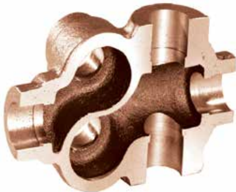
CUT AWAY OF BAC-2-BAC® SHOWING INTERIOR PASSAGEWAYS THAT DISTRIBUTE HOT AND COLD WATER WHERE NEEDED.

BAC-2-BAC® MANIFOLD distributes hot and cold water to fixtures mounted back to back on partition.