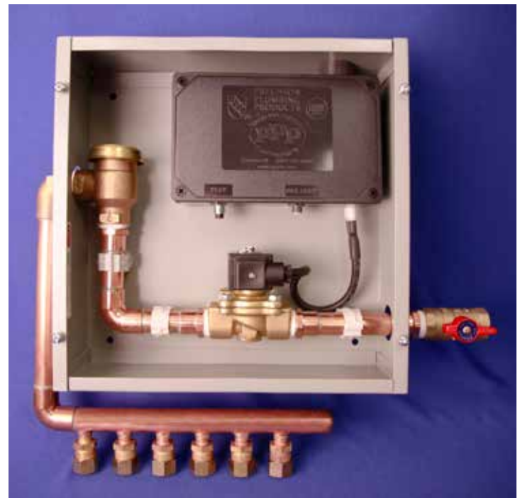
SURFACE MOUNT CABINET