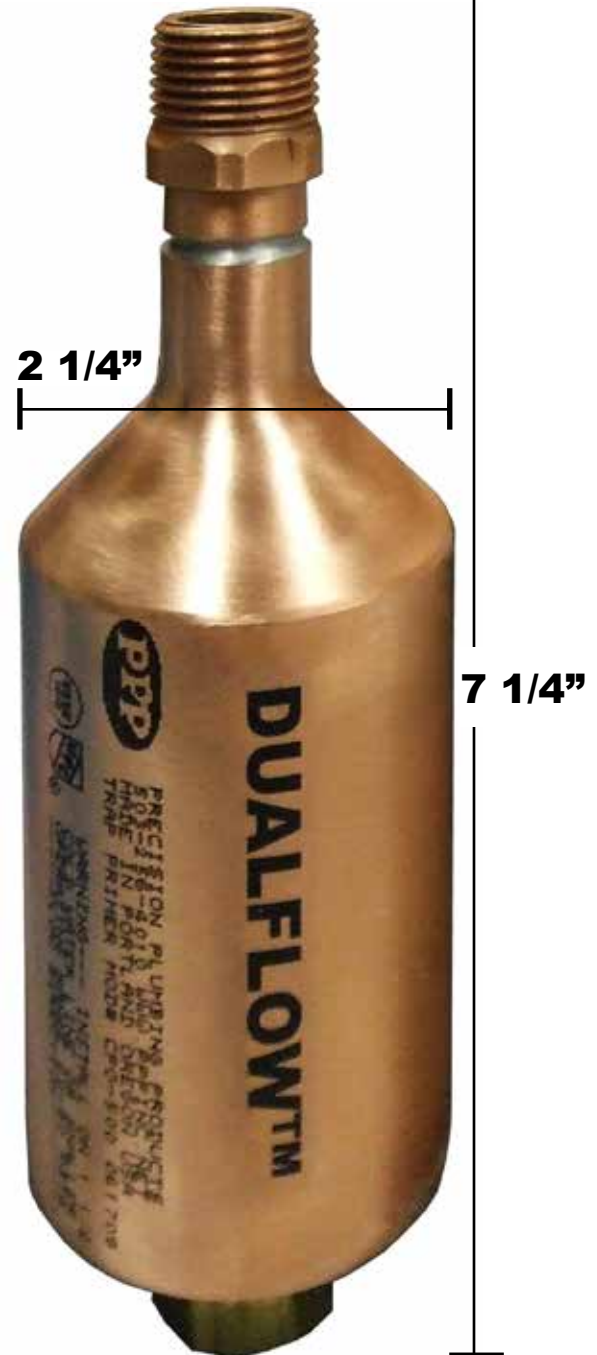
PART NO: CPO-500

Constructed of type K copper body, Sarlink 4145B diaphragm, #60 stainless steel mesh screen.