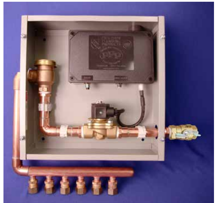
SURFACE MOUNT CABINET